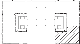
SUITE 200 USF 3,905 SQ FT SUITE 200 RSF 4,335 SQ FT