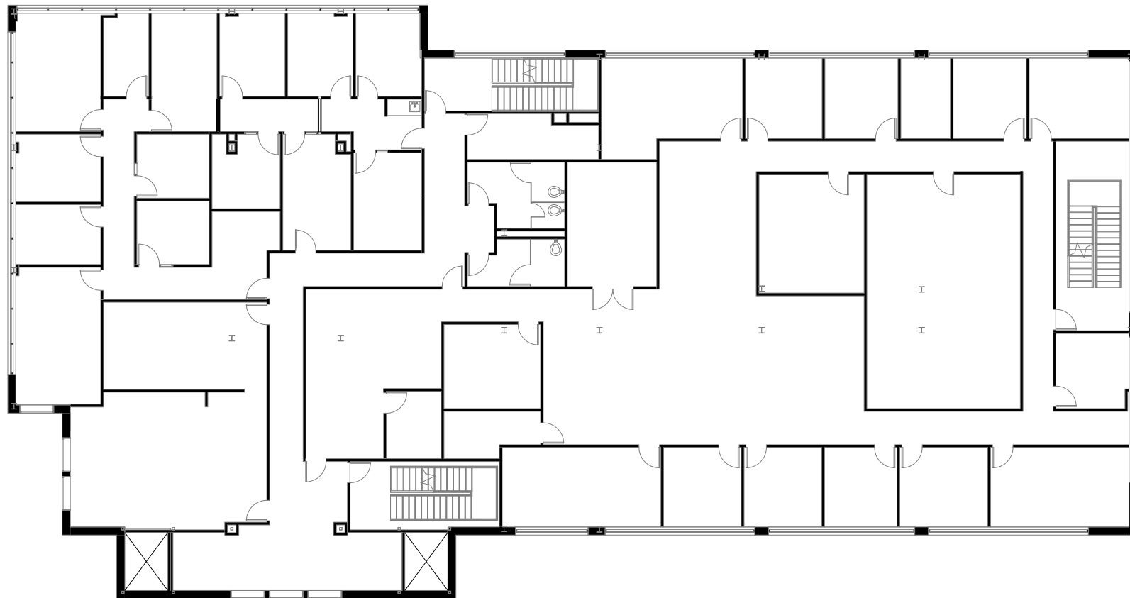
1 LEVEL 2 LEASE PLAN 1" = 20'-0"

OFFICE: (979)779-5757 MOBILE: (979)255-5700 FAX: (979)779-5701 EMAIL: jim@jsarchitects.com