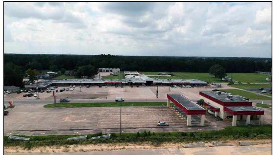
57,342 SF Retail Center with 7,920 SF Outparcel