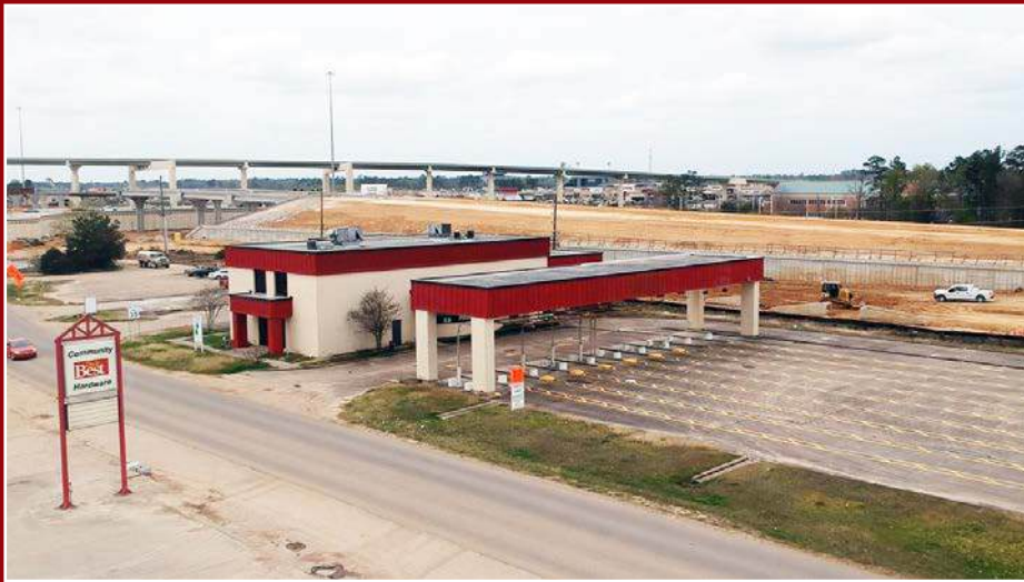
22475 Community Drive: 7,920 SF Outparcel Building