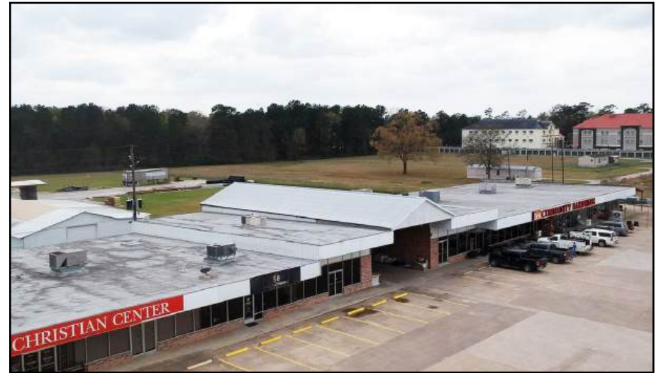
57,342 SF Retail Center