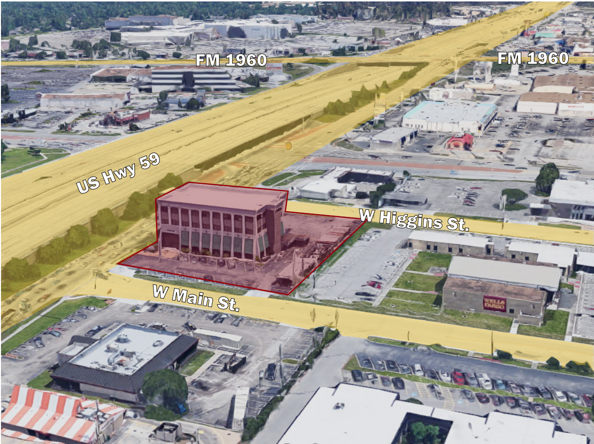
Office space for lease in the three-story Plus4 Credit Union building in downtown Humble. Vacant space available on the first, second and third floor.